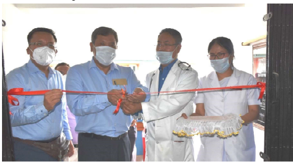
IT News Imphal, April 19: