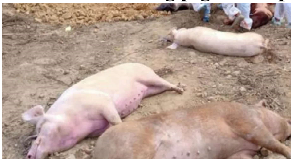
Agency Agartala, April 19:

The Animal Husbandry department of Tripura has sounded alarm after samples from a government farm sent to the North Eastern Regional Disease Diagnostic Lab for PCR test showed positive results for African Swine Flu.