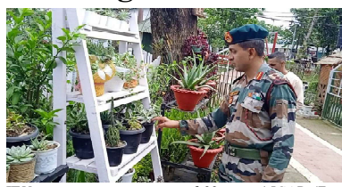
IT News Imphal, April 19:

Every year on 18 April world heritage day is celebrated with the aim to spread awareness about the dying cultures and natural heritage around the globe.